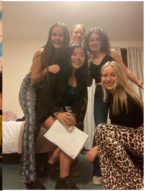
A few of the Alligator troublemakers pre-swap.